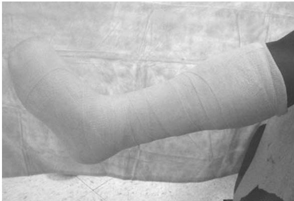
Fig. 2: Completed closed-toe total contact cast.

molded, while the ankle was maintained in a neutral position, defined as the foot at 90 degrees to the long axis of the tibia. Before application of the cast shoe, the bottom of the cast was flattened by resting the plantar aspect of the cast on a step stool. Casting was done with the patient sitting, and after 10 to 15 minutes, full weightbearing was allowed in a cast boot. Patients were given instructions in cast care and told to call at any time if they had pain, irritation, or a sense that the cast was too tight or too loose. Patients were seen for a cast change 3 to 4 days after initial casting, and then they were followed weekly.